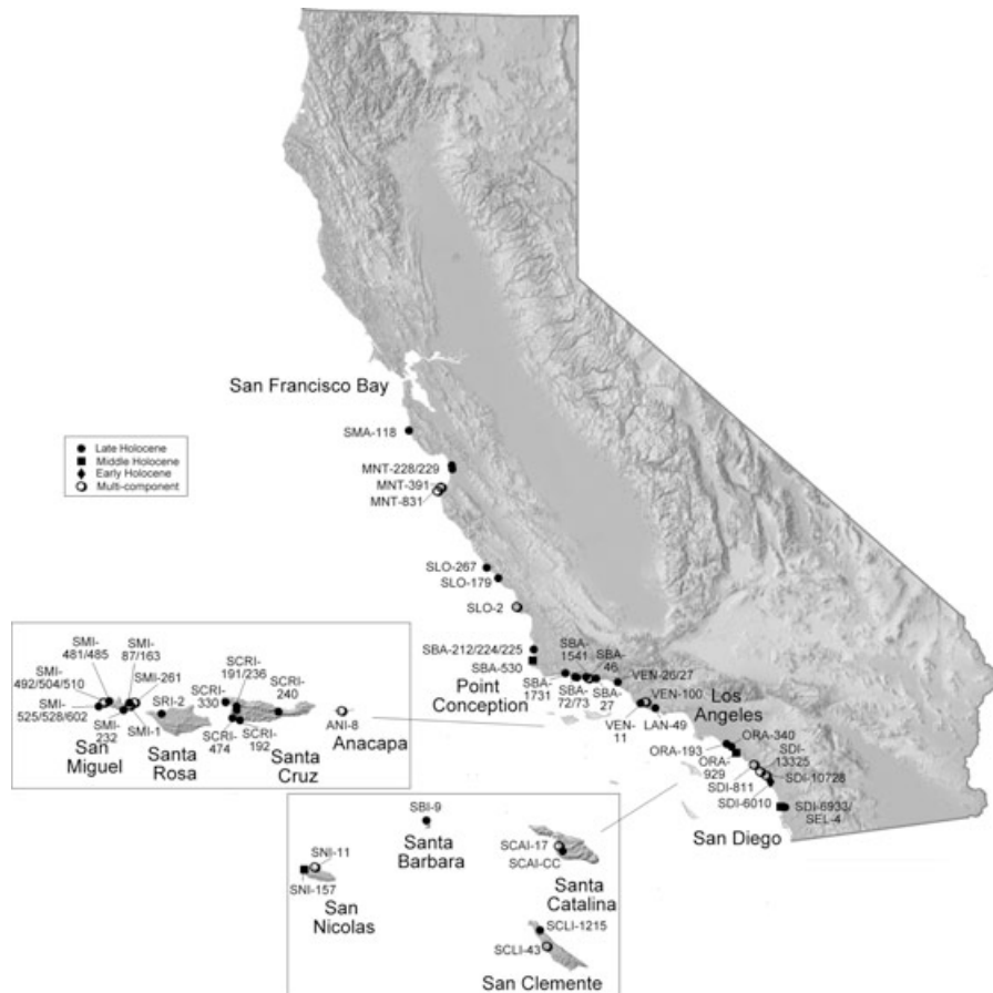
Figure 1. Location of archaeological sites containing Guadalupe fur seal remains in California.

specimens identified to species, excluding those that were identified solely as fur seal. We recorded bone and teeth counts and minimum number of individuals (MNI), an estimate of the total number of animals based on the frequency of non-repetitive elements (Grayson 1984, Lyman 2008). When available, we also included age and sex estimates.